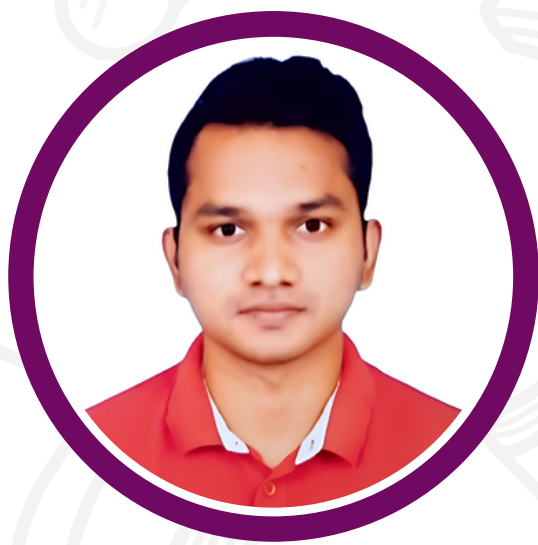
T BHUVANESHAM AIR 41