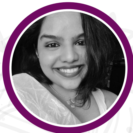
ARCHISHA B. AIR 404